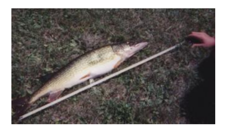
PHOTO #8, pickerel angled scientifically to get a more accurate, i.e, longer, measurement. To get absolutely impeccable, documented, photographic proof of that moment when you become One with the Universe.

Un-numbered PHOTO: Bob with PICKEREL , uppercase, italics, and bold because it appeared mysteriously in the