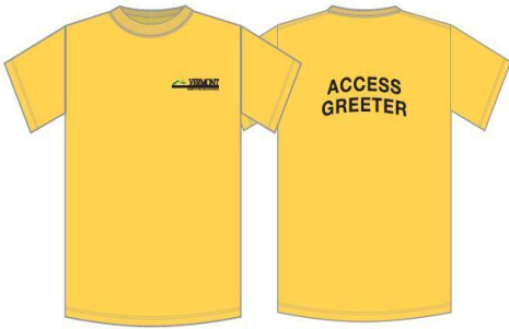
Access Greeter t-shirt

Greeter Program Training Manual, sandwich board welcome signs, t-shirts, and educational handouts are free to any Greeter Program.