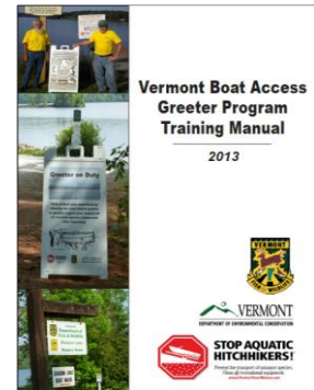
Greeter Program Training Manual